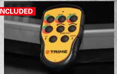
R.O.T. SYSTEM Remote Control 50mt range