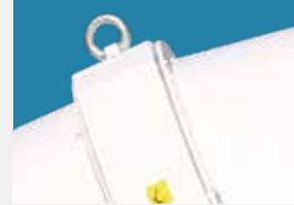
Central LIFTING EYE