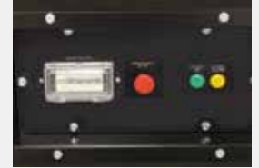
Integrated CONTROL PANEL