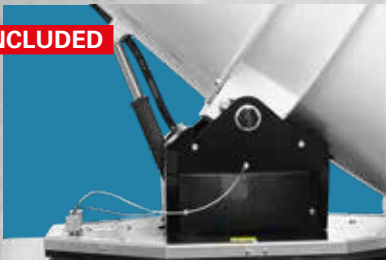
R.O.T. SYSTEM Electric Tilting System