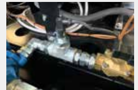
Safety PRESSURE SWITCH