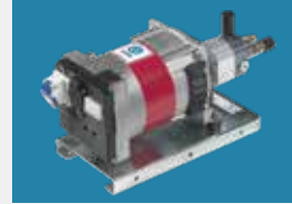
HYDRAULIC GENERATOR included