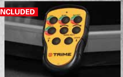
R.O.T. SYSTEM Automatic Oscillation 340 °