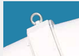
Central LIFTING EYE