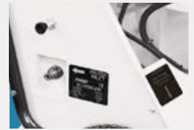
WATER CONNECTION Gardena brass adaptor male 3/4" gas thread