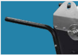
MOBILE Handles and wheels for easy maneuverability