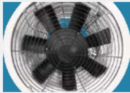
FAN 6 blades fan, complete with aluminium hub