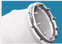
COVERAGE 12 - 14 m